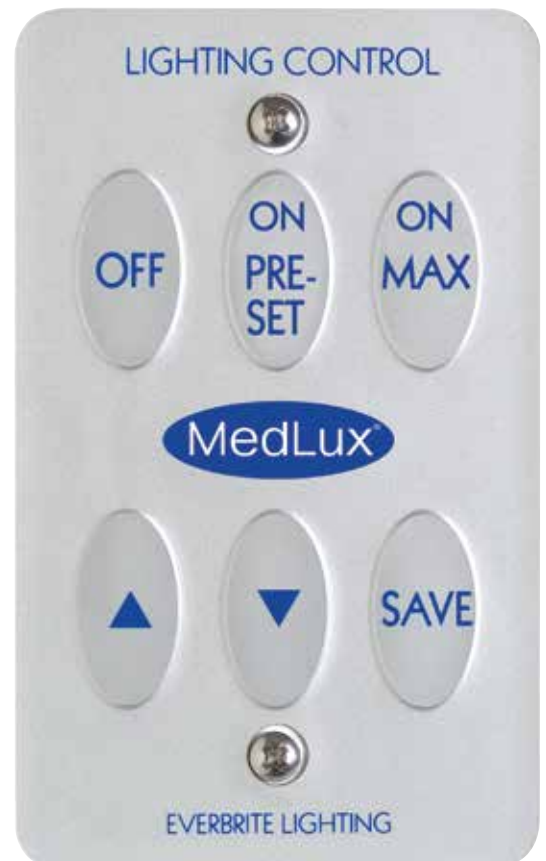
MedLux™ Dimmer - approximate size