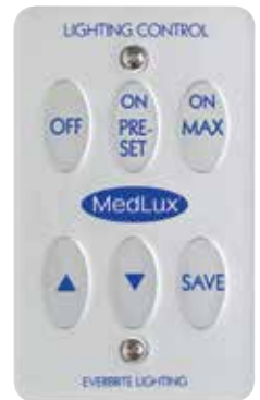
MedLux® XLS Dimmer Keypad

The positive feedback keypad allows for full brightness "ON MAX", 100 levels of dimming, "OFF" and an "ON PRESET" that recalls a user set level stored in memory. The ON MAX setting produces full brightness for cleaning, maintenance and emergencies, while ON PRESET activates a pre-programmed light level for performing scans, set by the user. Smooth dynamic operation is achieved without changing the white level color temperature from the MedLux® LED lamps & illuminators.